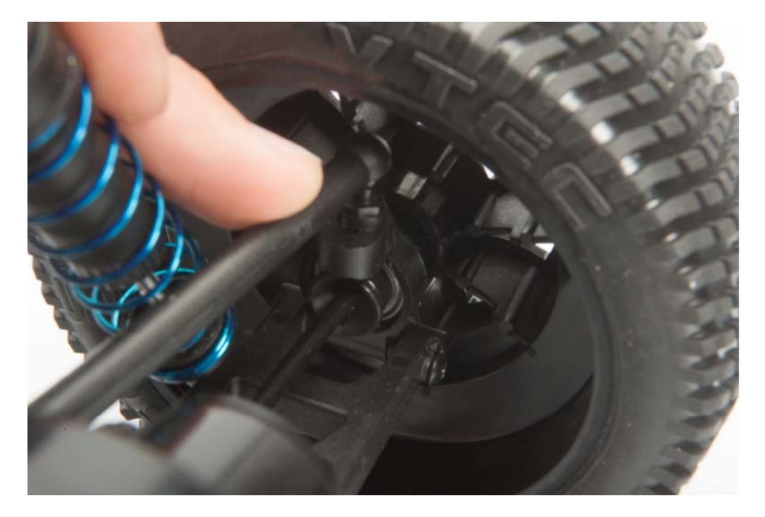
Make sure the suspension moves smoothly and the wheel rotates freely. Repeat on the other side of the vehicle .

Insert the other end of the dogbone into the outer outdrive, stand the wheel up straight and press the turnbuckle back onto the ball head.