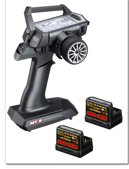
Sanwa MT-S Dual-RX Set 2x RX-481, 2.4GHz