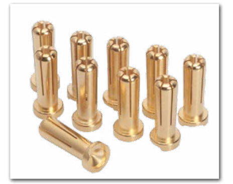
LRP 5mm Gold Works Team connectors (10 pcs.)