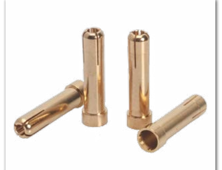
LRP 5mm to 4mm Gold Works Team adapter plug (4 pcs.)