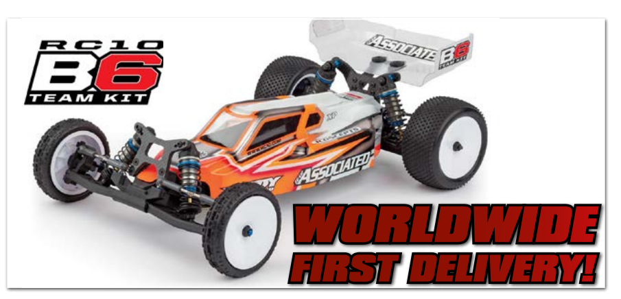
Team Associated RC10B6 Team Kit