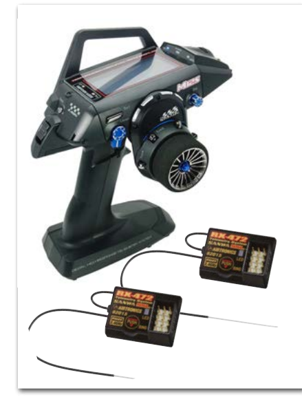
Sanwa M12S Limited Edition Blue-Al Dual-RX Set