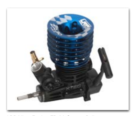
LRP Nitro Engine ZR.30 Spec.4 Pullstart