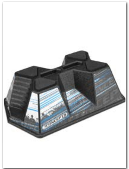
JConcepts - Aero Car Stand