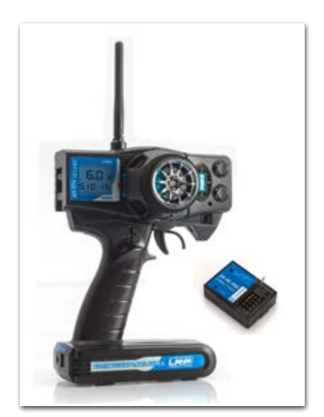
LRP B3-STX Deluxe 2.4GHz Transmitter