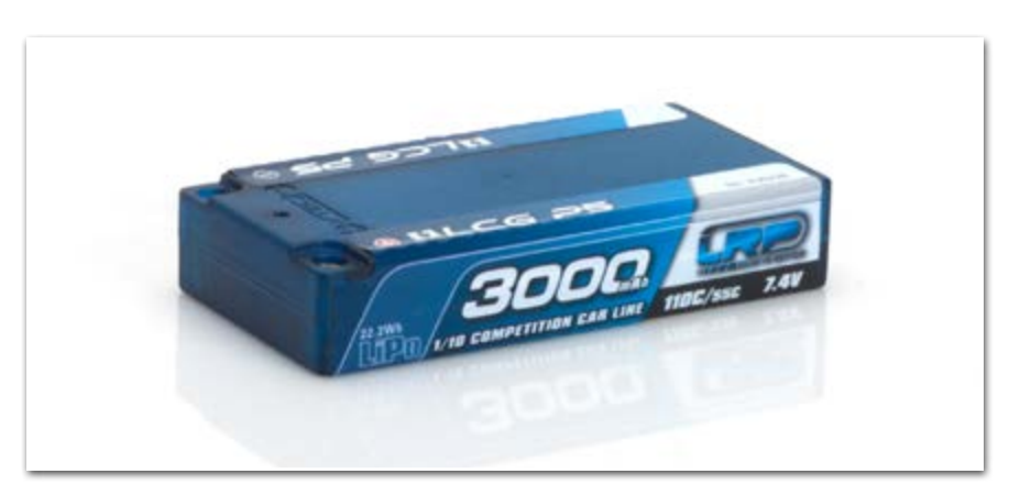
LRP 3000 - Shorty LCG P5