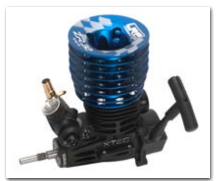
LRP Nitro Engine ZR.32 Spec.4 Pullstart