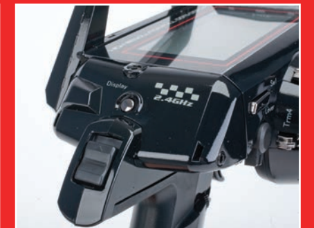
The buttons are all conveniently placed for easy access

most accomplished surface receivers. Natively supporting the company's fastest FH4 frequency hopping signal protocol, the RX-471 sports a full four-channel operation and has long since been a firm favourite with many racer thanks to its tiny footprint and incredible lightweight.