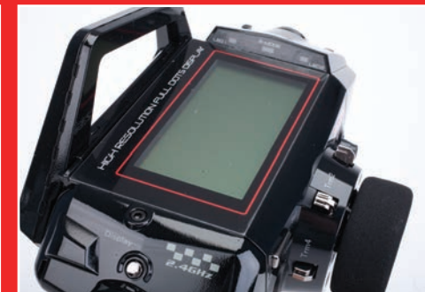
The piano finish is highlighted against the black and red strip around the large LCD screen