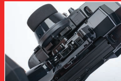
The 40th Anniversary Edition uses the same proven, world championship-winning M12 chassis

range topper and you'd expect it to be pretty well loaded and partly it's also because the broad usage profile of surface RC users is so vast these days that you wouldn't be able to please everyone without adding features that may only have limited appeal to certain sectors. Fortunately, functionality comes these days courtesy of some pretty slick software programming and so, as with every electronic device from full-size family cars to washing machines, user functionality can be programmed to fulfil a whole myriad of functions that would have once required bespoke hardware to achieve. The flip side of this code-driven flexibility is always that the ease of use and feature